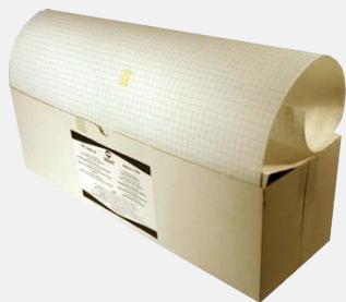
Part N°: 84296 - 600mm roll

An easy way to replace the inner door skin membrane.